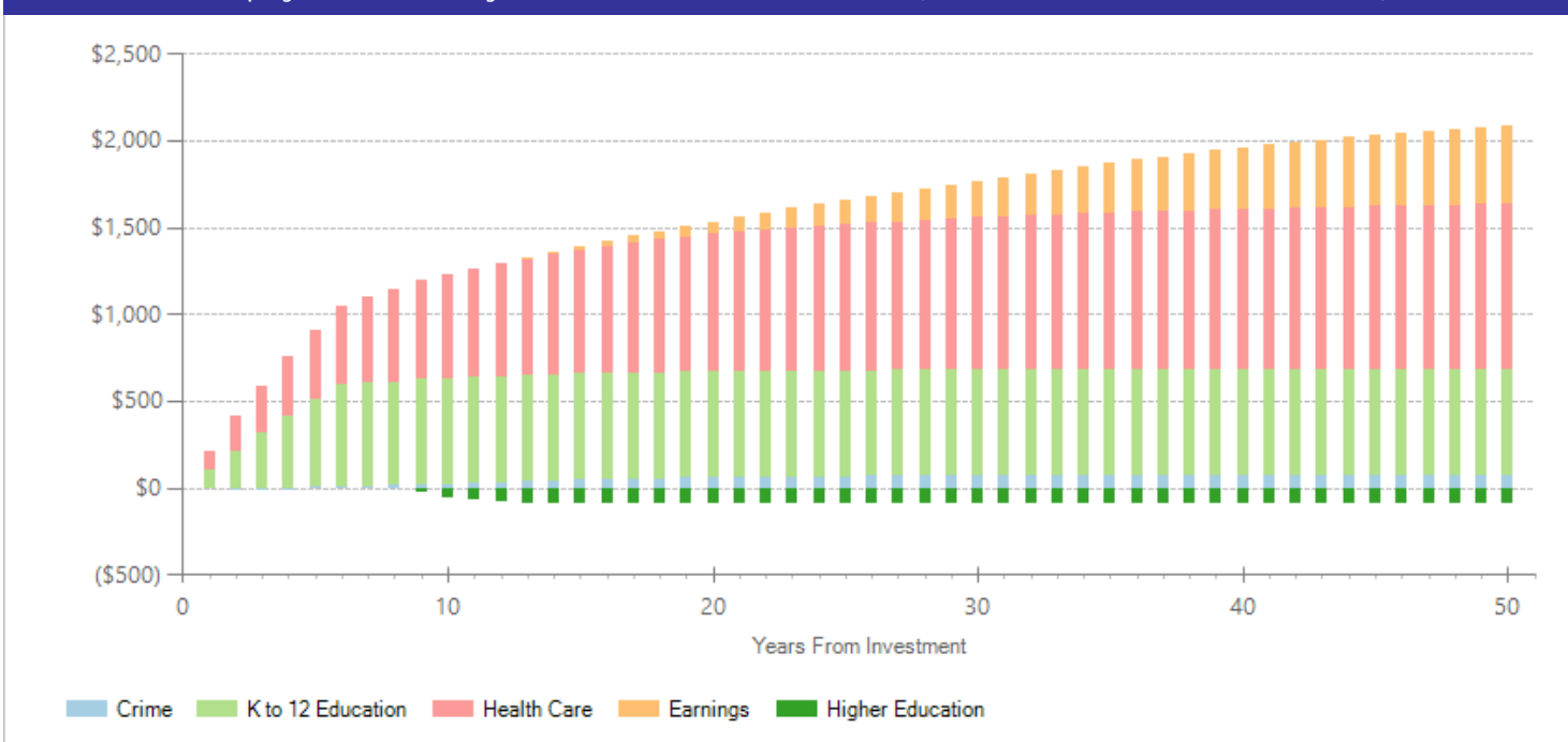
Taxpayer Benefits by Source of Value Over Time (Cumulative Discounted Dollars)

The graph above focuses on the subset of estimated cumulative benefits that accrue to taxpayers. The cash flows are divided into the source of the value.