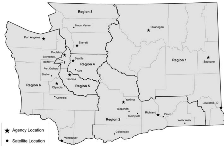
Exhibit 1 Independent and Transitional Living Programs in Washington State, 2008

Washington State funds these programs with approximately $2.5 million in federal funds through the Chafee Foster Care Independence Program. 1 In the fall of 2008, 12 contractors provided these services. Exhibit 1 displays these programs and their locations.