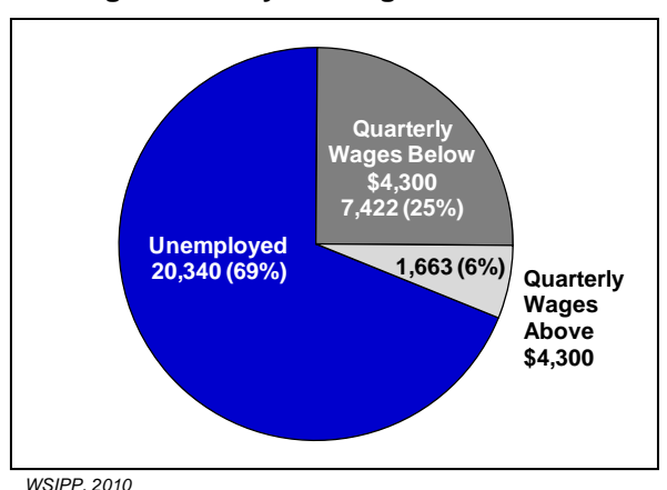
Exhibit 5 Average Quarterly Earnings After Treatment